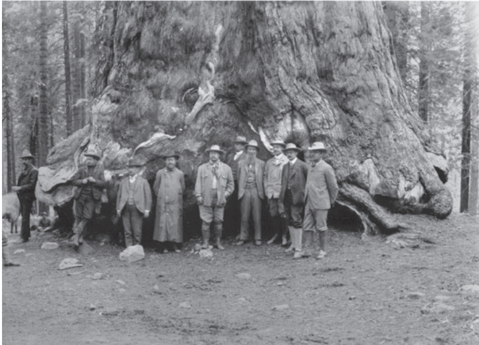
Figure 2. President Theodore Roosevelt's party at the Grizzly Giant, Mariposa Big Tree Grove, 1903.

roots," suited a nation-in-the-making populated by immigrants and chock-a-block with ideas and creeds.